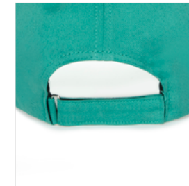
clasp velcro strap

*for your brand requirements we can provide all decoration technics. Just ask!