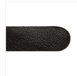
belt dark brown