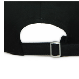
clasp metal buckle