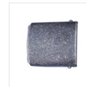
latch old silver