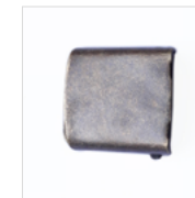
latch old gold