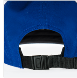
clasp plastic clipper