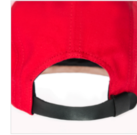
clasp metal buckle